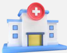
पथरी शनिश्चरे नगर अस्पताल कोशी प्रदेश