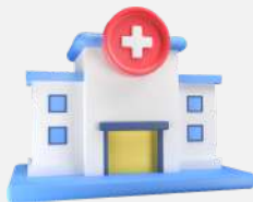
गोकर्णेश्वर नगर अस्पताल बागमती प्रदेश