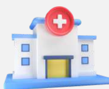
चाँगुनारायण नगर अस्पताल बागमती प्रदेश