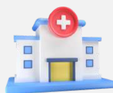
कन्काई नगर अस्पताल कोशी प्रदेश